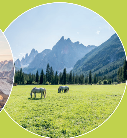
Val Fiscalina Fischleintal Valley